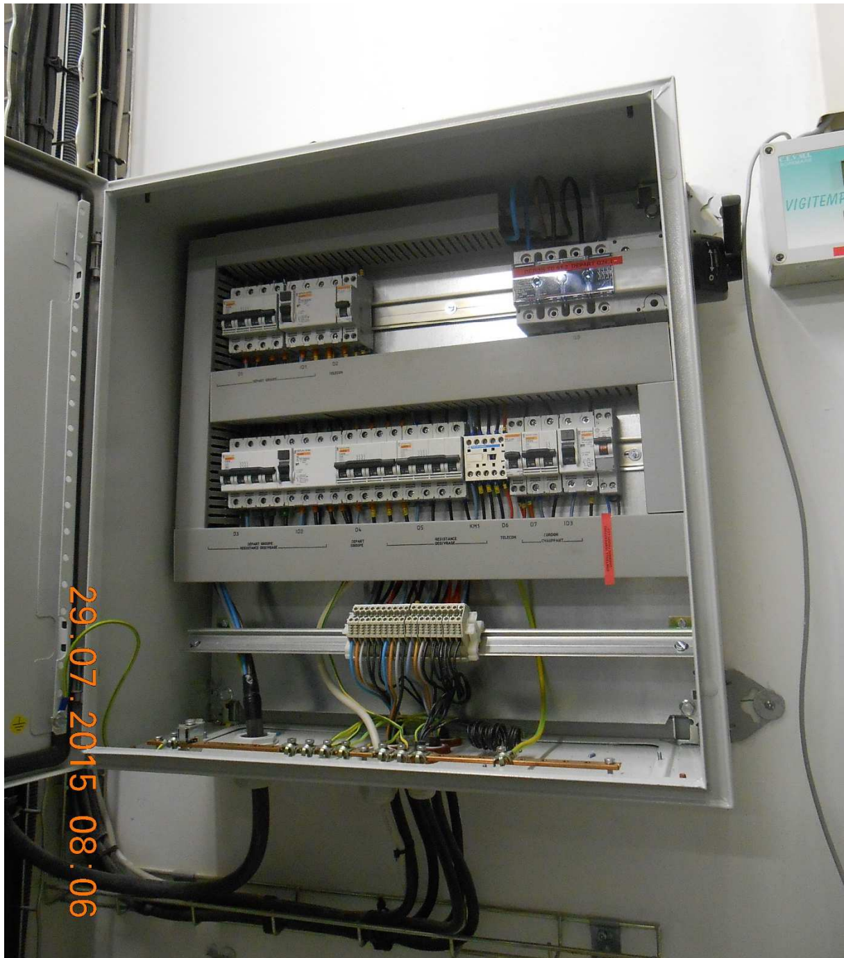
Détail coffret chambres froides