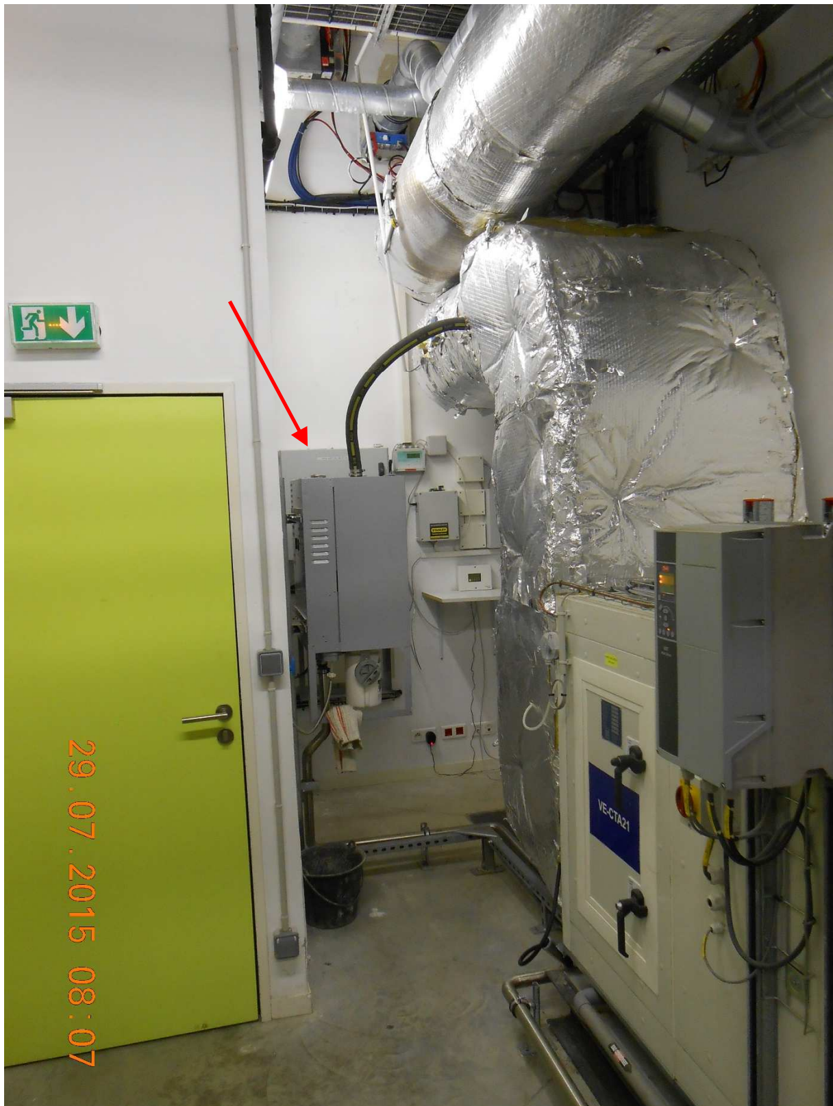
Emplacement coffret chambres froides dans local CTA 21